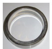
NYCO GREASE® GN 3058