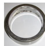
MARKET REF (LIX)